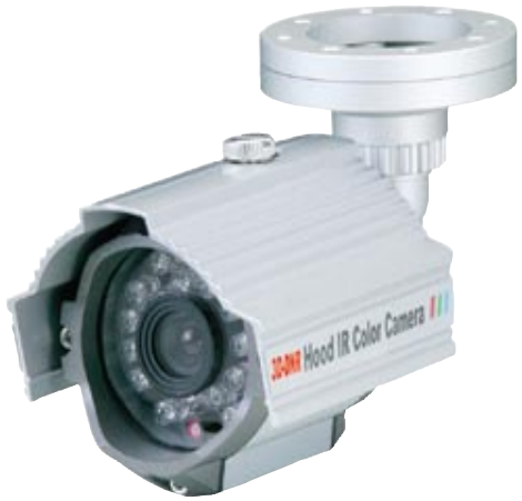
▶ HD-N640DNR 550TV Lines 6mm Fixed Board Lens 850nm IR LEDs * 24pcs